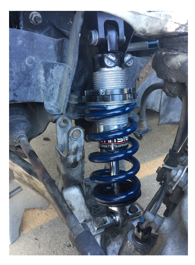
Thanks to our friends at Fox Speed Division out of Orem, UT for providing photos of their install of our coilover kit.