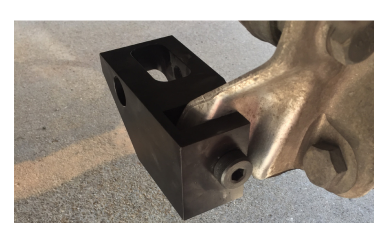
NOTE: Due to casting variances, you may have to shim OR slightly shave the stock knuckle to properly fit the lower shock mount